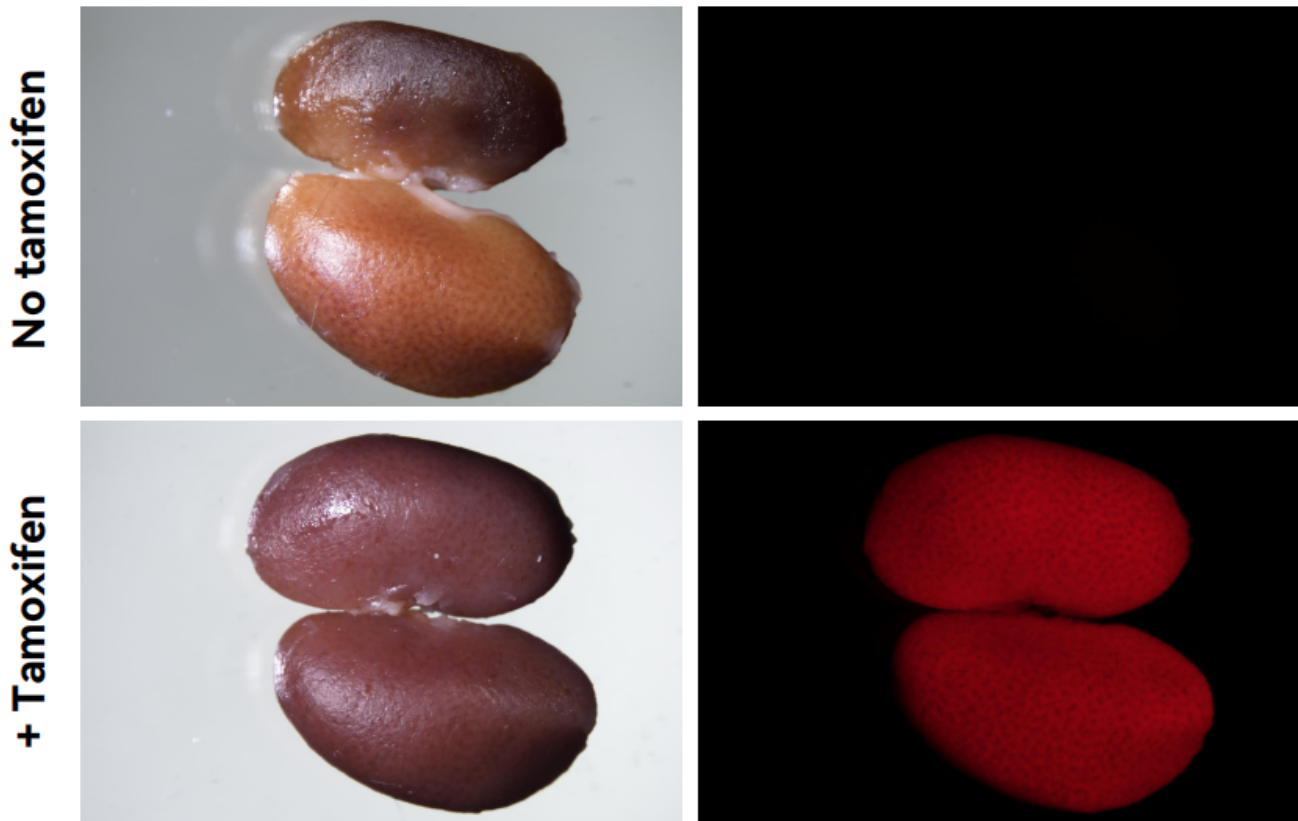
Fig1. CreERT2-mediated recombination in kidney of Slc34a1^{CreERT2/+} ; Rosa26^{tdTomato/+} mouse.