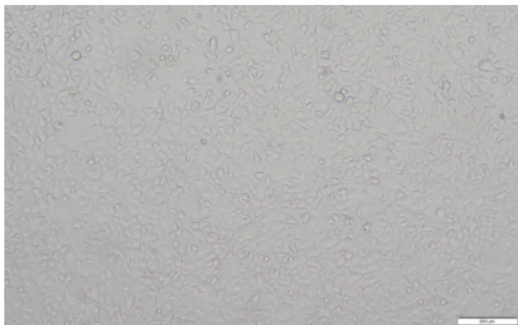
Fig1. Morphology of EBC-1 cell line.