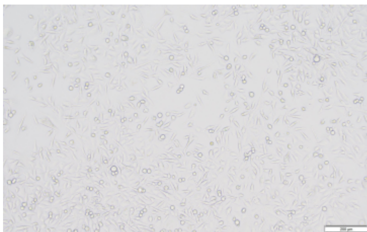
Fig1. Morphology of PC-3 cell line.