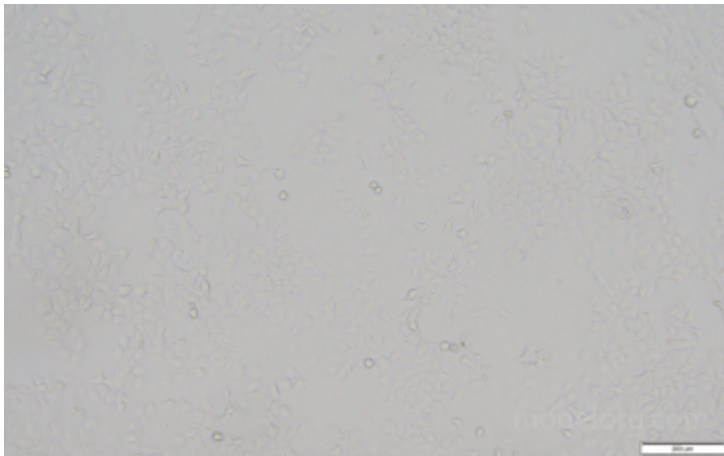
Fig1. Morphology of MCF7 cell line.